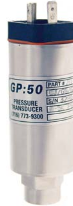
(Shown with 'CJ' Option)