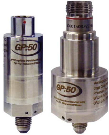
(Low Range) <50 PSI

All GP:50 Aerospace pressure transducers are manufactured and tested to the following MIL-STD and MIL-Spec standards to insure the highest quality assurance: