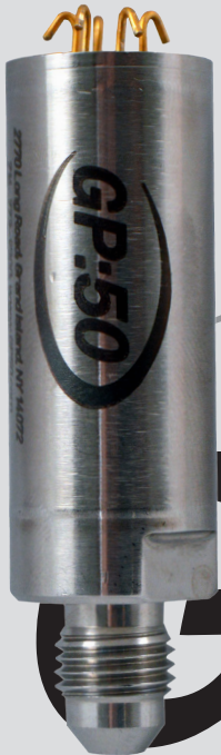
Model 120 Downhole Pressure Transducer