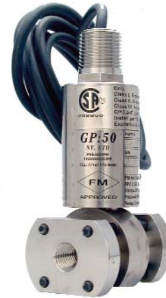
(Shown with "315X" + "HM" option)